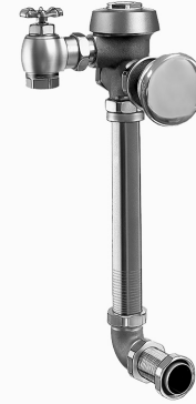
Variation Not Shown: 3" Metal Oscillating Push Button